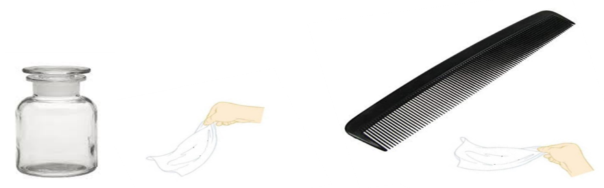
Fig. A: Glass Bottle & Woolen Cloth